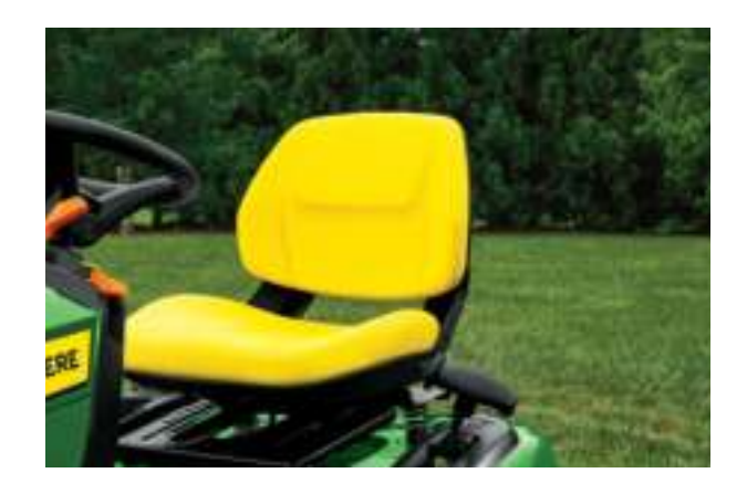
38 cm seat

(available on S110, S120, S130, S140, X147R and X167R)