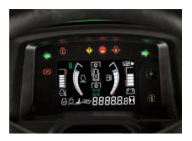
The dashboard approach – Electronic Fuel Gauge. Engine Temperature Gauge. Tachometer with Best Cut Target Zone. An Electric Power Take-Off (PTO) engagement indicator. All at a glance and within easy reach.

** Term limited to 4 years or 700 hours used, whichever comes first, and varies by model. See Agriculture and Turf equipment Warranty Statement at JohnDeere.com.au or JohnDeere.co.nz for details.