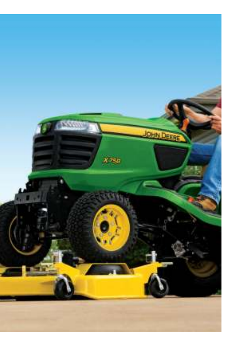
With an AutoConnect deck, attaching and removing your mower deck is easier than ever. Drive over ramps can quickly be removed, without tools, for access to mower deck.