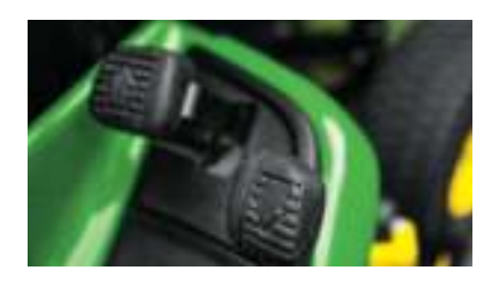
Twin Touch<sup>™</sup> System

This exclusive feature allows you to conveniently level the deck from just below the seat.