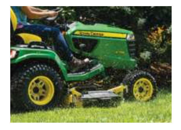
A high-capacity mower deck, solid stamped out of 9-gauge steel to handle the tall stuff.